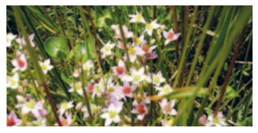
TAKEN ROOT IN THE WET FOOTPRINTS OF GRAZING ANIMALS: HAIRY STONECROP, THREATENED WITH EXTINCTION

Modern sowed grassland often consists of a maximum of ten different grass and legume species. In contrast, 200 or more plant species thrive in large-scale, extensively used pastures. Unfertilised mountain meadows and grazed calcareous oligotrophic grassland are particularly rich in species. On a large scale, the number of species increases when grassland is grazed extensively and all-year round, leading to a greater diversity of habitat conditions for flora and fauna. Moreover, grazing landscapes constitute an ideal foundation for an effective biotope network.