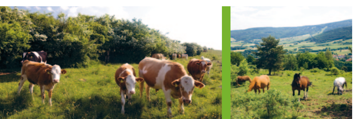
COPSES ACT AS A REFUGE AND HABITAT – UP TO 30% OF SUCH LANDSCAPE FEATURES SHOULD BE ELIGIBLE

It should be possible to integrate up to 30% of landscape features – in particular copses – into the eligible area, reducing administrative costs. After all, it is virtually impossible to measure copses, which are often eaten away and occurring in different parts of a pasture over the years, and to exclude them from the effective area. In addition, successional and scrub encroachment stages often substantiate the special value of extensive grazing landscapes. On the other hand, it must be possible to reduce excessive scrub encroachment. Due to this dynamic, landscape features on extensive pastures should be removed from the cross compliance (CC) obligation.